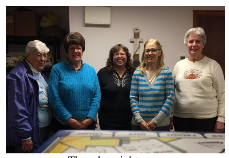
Thursday night crew