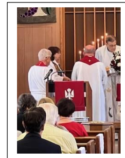
Holy Communion Clergy